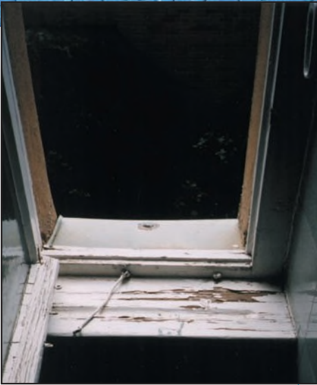
Leaky window - mold is beginning to rot the wooden frame and windowsill.

If you already have a mold problem - act QuicKLY. Mold damages what it grows on. The longer it grows, the more damage it can cause.