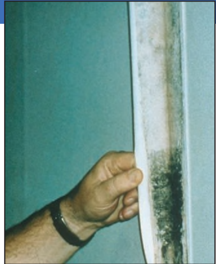
Mold growing on the back side of wallpaper.

suspicion of hidden mold You may suspect hidden mold if a building smells moldy, but you cannot see the source, or if you know there has been water damage and residents are reporting health problems. Mold may be hidden in places such as the back side of dry wall, wallpaper, or paneling, the top side of ceiling tiles, the underside of carpets and pads, etc. Other possible locations of hidden mold include areas inside walls around pipes (with leaking or condensing pipes), the surface of walls behind furniture (where condensation forms), inside ductwork, and in roof materials above ceiling tiles (due to roof leaks or insufficient insulation).