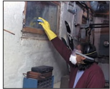
Cleaning while wearing N-95 respirator, gloves, and goggles.