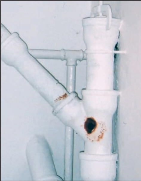
Rust is an indicator that condensation occurs on this drainpipe. The pipe should be insulated to prevent condensation.

renters: Report all plumbing leaks and moisture problems immediately to your building owner, manager, or superintendent. In cases where persistent water problems are not addressed, you may want to contact local, state, or federal health or housing authorities.