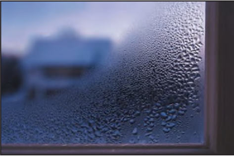
Condensation on the inside of a window-pane.