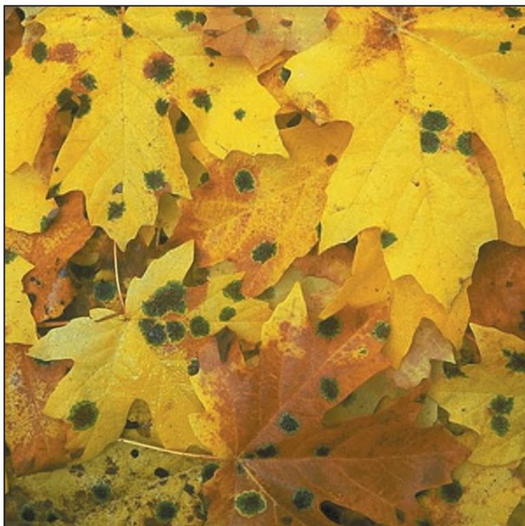
Mold growing on fallen leaves.

This document is available on the Environmental Protection Agency, Indoor Environments Division website at: www.epa.gov/mold