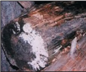
Mold growing outdoors on firewood. Molds come in many colors; both white and black molds are shown here.

W hy is mold growing in my home? Molds are part of the