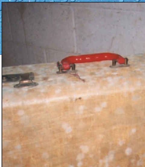
Mold growing on a suitcase stored in a humid basement.

It is important to take precautions to liMit Your exPosure to mold and mold spores.