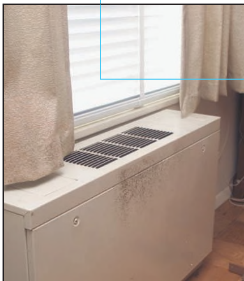
Mold growing on the surface of a unit ventilator.